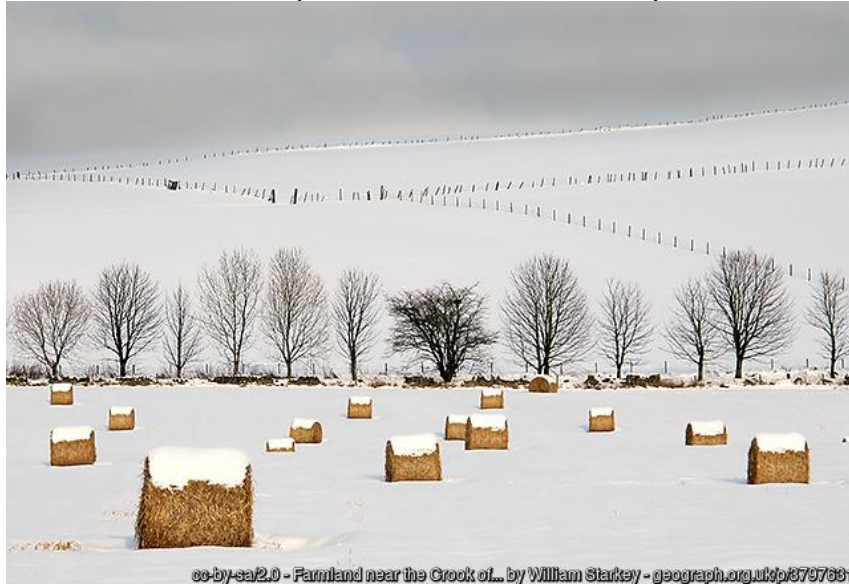
January 2014