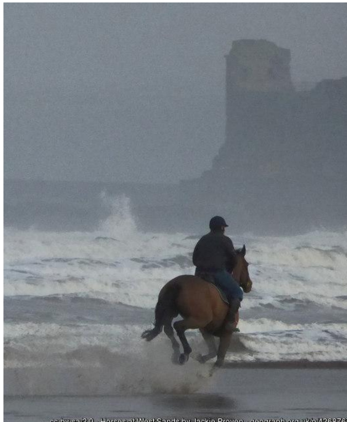
December 2014 – Jackie Proven

cc-by-sa/2.0 - Horses at West Sands by Jackie Proven - geograph.org.uk/p/4268767