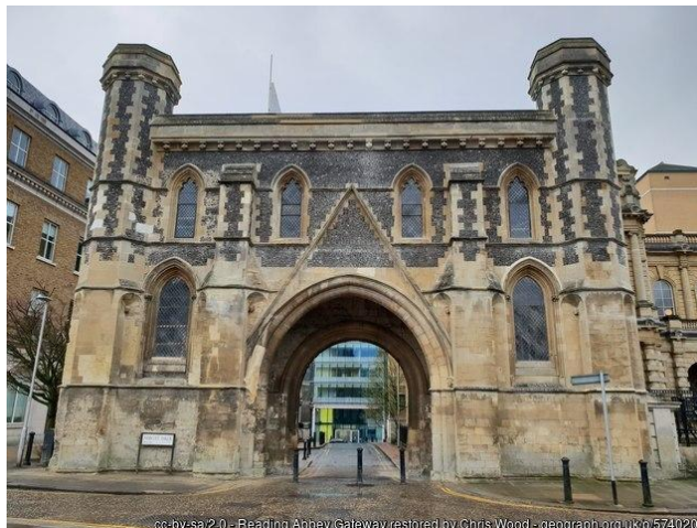
S H Grimm, Reading Abbey Gatehouse c1785 https://www.geograph.org.uk/photo/8071615

The eclectic diversity of contributor’s interests, knowledge and specialities, widespread geographic locations, and downright dogged determination have been significant contributory factors to the success of the project. Geograph is different things to different people, competitive or collaborative, and is all the better for it.