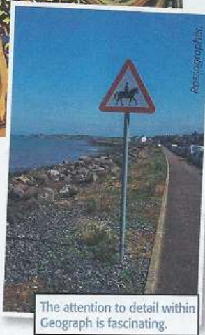
The attention to detail within Geograph is fascinating.